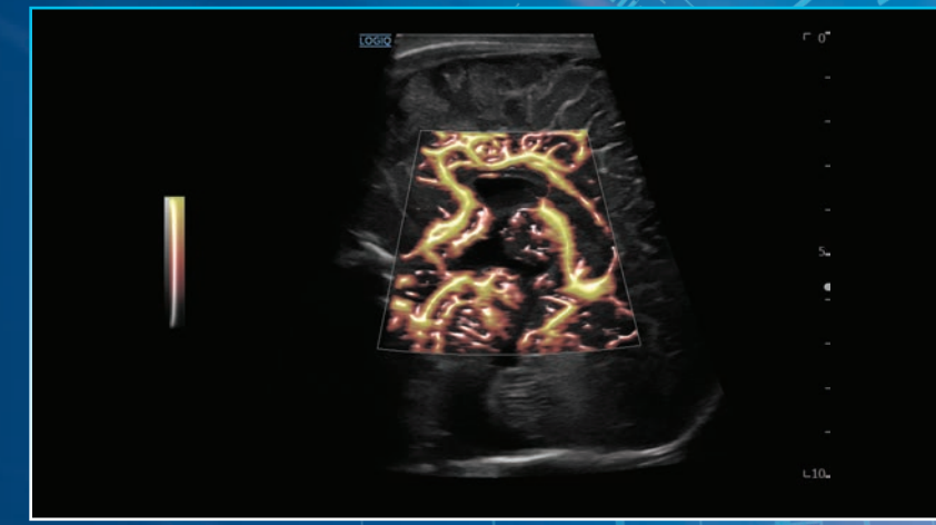
Neonatal brain with MVI & Radiant flow, L2-9-D