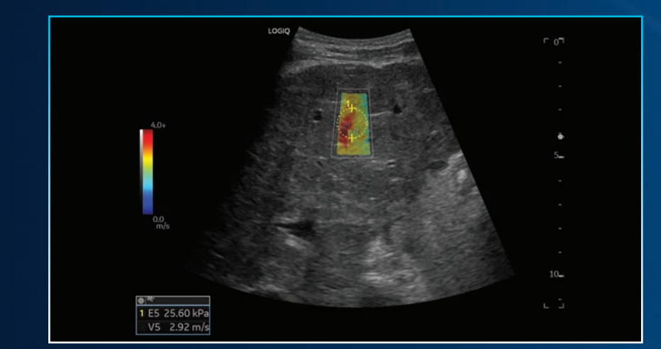
Liver 2D Shear Wave Elastography, C1-6-D